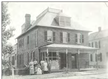
KLEIN'S BAKERY, CIRCA 1905.

Introduce new street trees in grates and new bike racks.