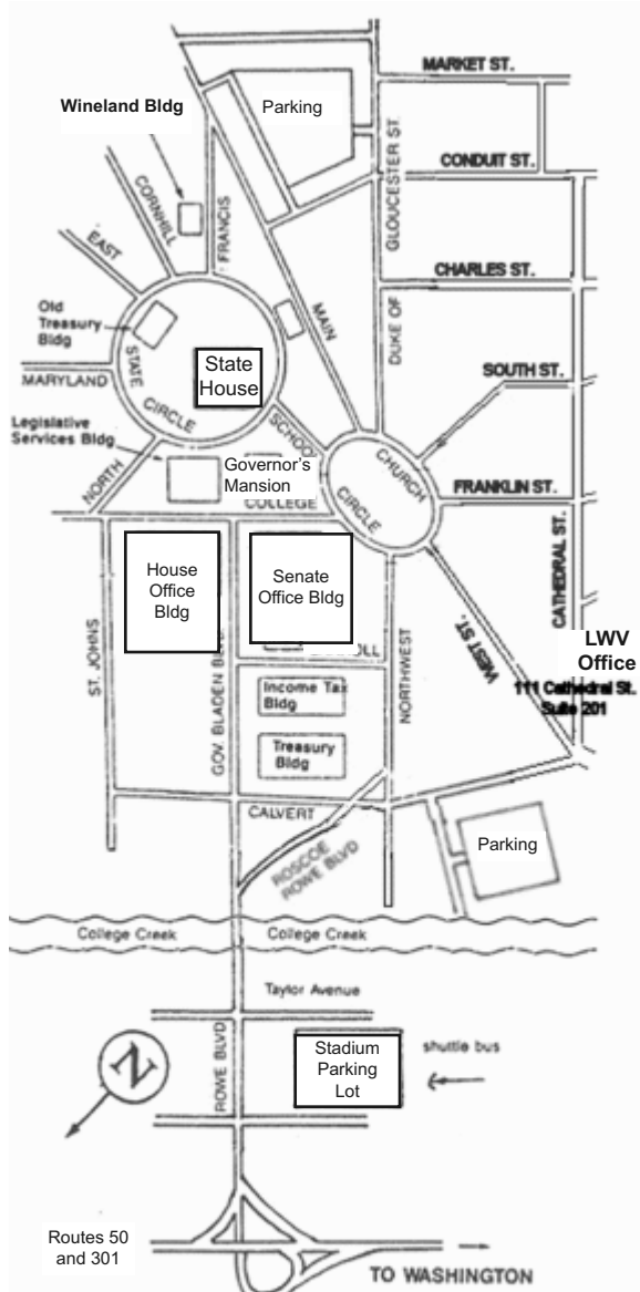
MAP OF ANNAPOLIS

All Committees have both 410-841-xxxx and 301-858-xxxx phone numbers.