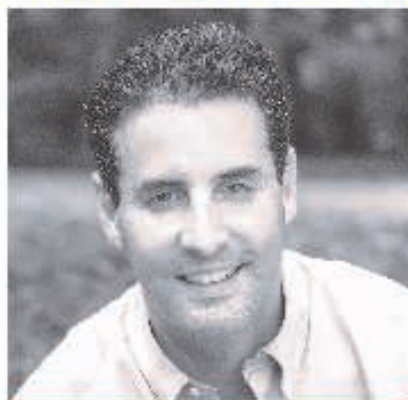
JOHN SARBANES (Democratic Party)