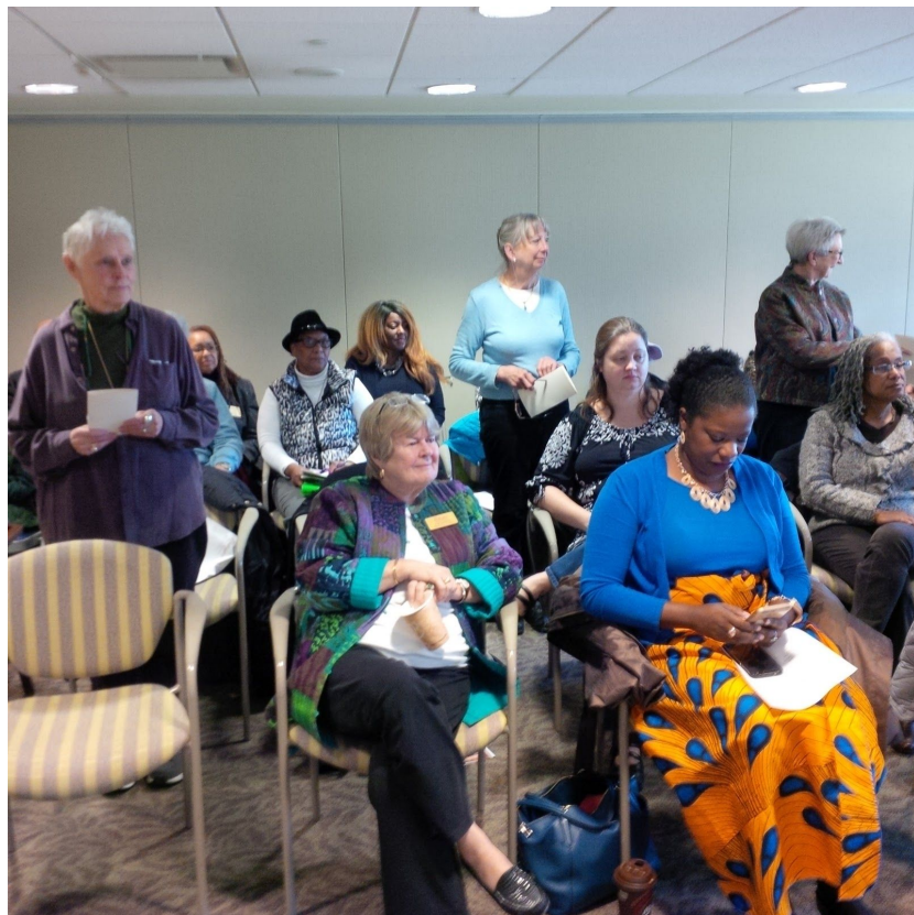
Members at the March 4th Meeting at Collington Life Center