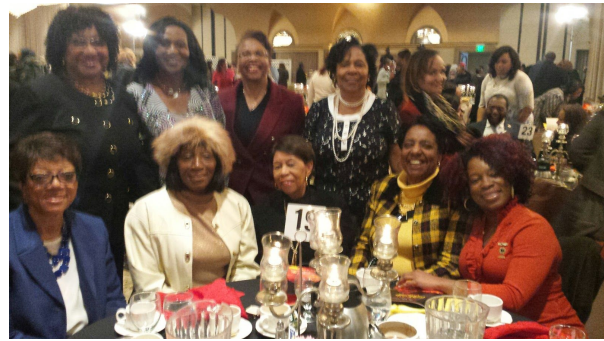
Members of LWVPGC at the Women's History Month Luncheon