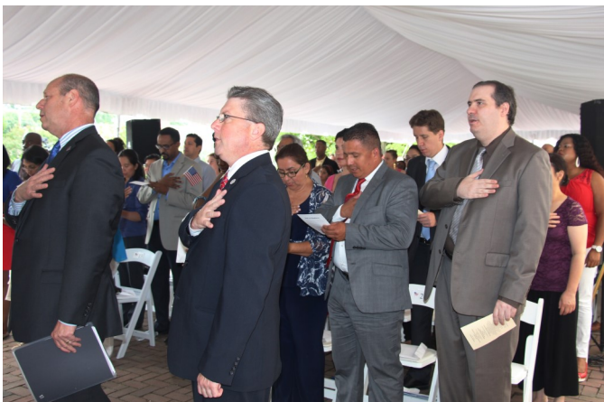
New citizens pledge allegiance to the American flag during their naturalization ceremony on July 4, 2016.