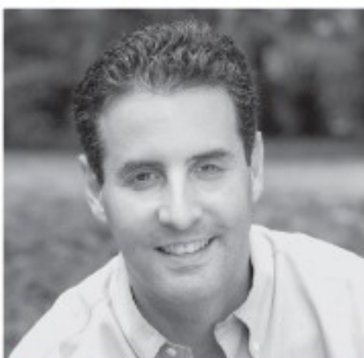
JOHN SARBANES (Democratic Party)