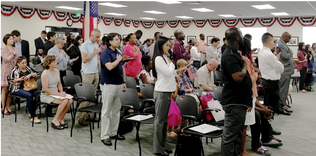
Immigrants supported by family and friends pledge allegiance to the flag of the United States of America during a naturalization ceremony at the USCIS Baltimore Field Office.