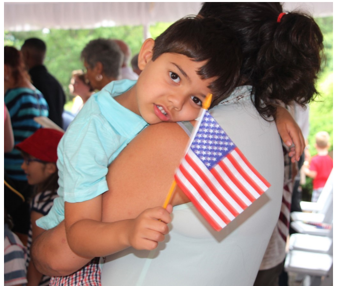
Family supporter during citizenship ceremony, July 4, 2016.