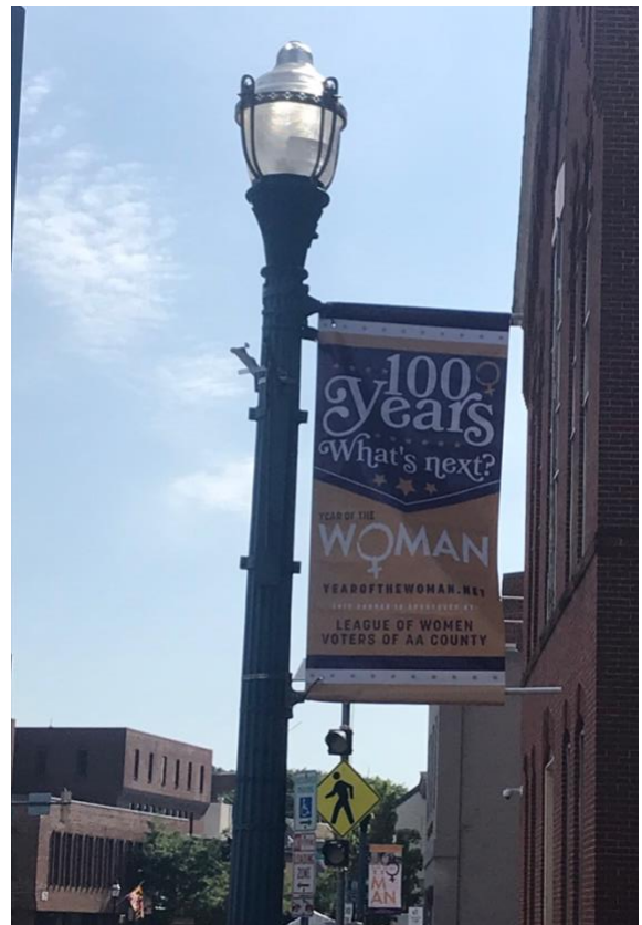
In August, the LWVAAC banner was displayed on West Street in Annapolis.

Collaboration with the Anne Arundel County Public Library (AACPL) expanded, in person and virtually, with the active support of staff at AACPL headquarters and individual branches. AACPL offered its robust Web presence, email network and curbside pickup service as conduits for promoting League programs and distributing LWVAAC election information. Mutual AACPL-LWVAAC Webpage/ Facebook links were established. The League was offered promotional tools for its own, as well as AACPL, programs. AACPL designed a poster and extensive publicity for what was to be a LWVAAC community program featuring Kate Campbell Stevenson in "Amending America: How Women Won the Vote."