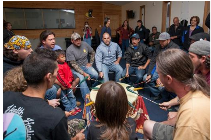
Huntley Brook Singers and Spirit Circle