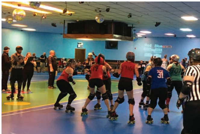
Maine Roller Derby on November 9 in Portland

Historically, roller derby is a pioneering feminist sport, that seeks to empower women, smash gender norms, and get out from under the shadows of privilege. Roller derby players are tough. They cultivate swagger, feed on contact, and have cool nicknames.