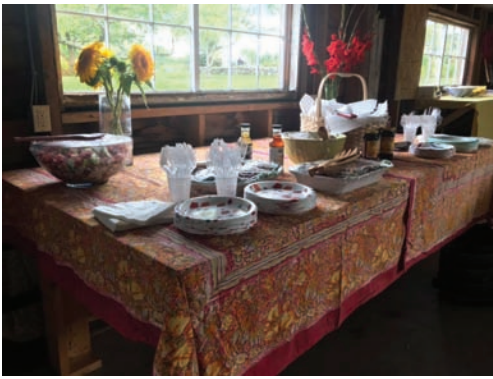
"Barn Party " Fundraiser for Maine- Wabanaki REACH hosted by Carol Wishcamper September 8, 2019