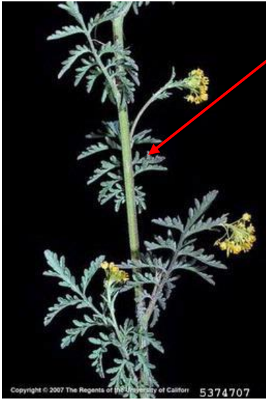
Fig. 6 Descurainia pinnata -native