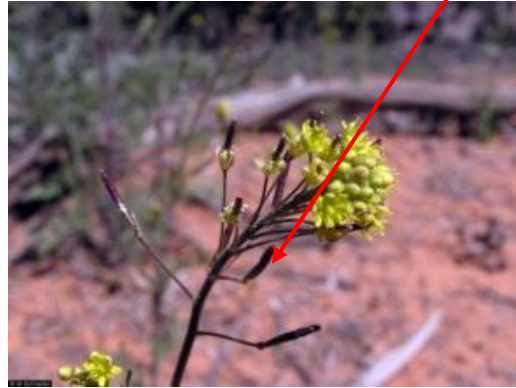
Fig. 7 Descurainia pinnata – Tansy Mustard