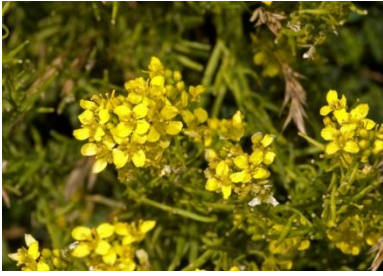
Fig. 1 Flowers

Indian hedgemustard Sisymbrium orientale Mustard Family (Brassicaceae)