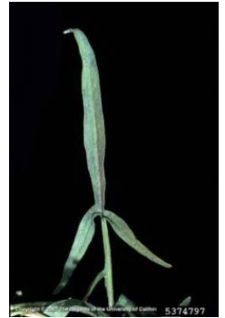
Fig. 3 Lower Leaf

Pulling tips ▪ Pull and bag (bake the seeds) before disposal