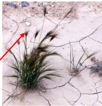
Fig. 2 Aging grass