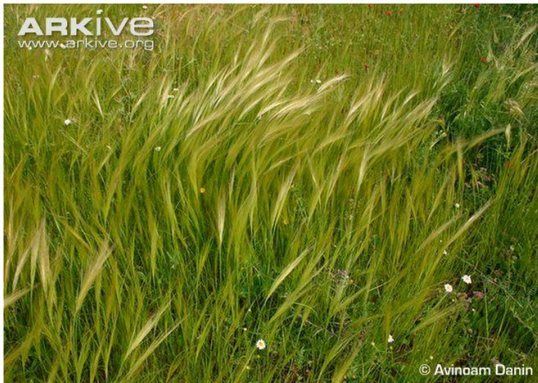
Fig. 3 Dense stand of needle grass

Similar Native Species: Elymus or Squirrel tail