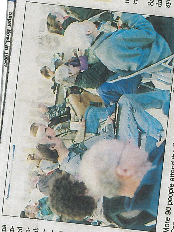
More 90 people attend the Saturday meeting of the Morongo Basin Conservation Association.