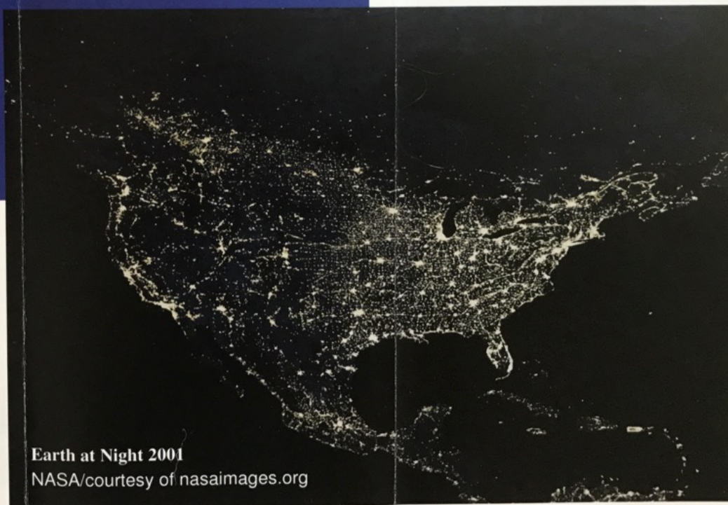
Earth at Night 2001