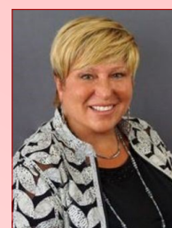
Mayor Theresa Bergen Howell