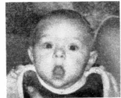
Life is Amazing!