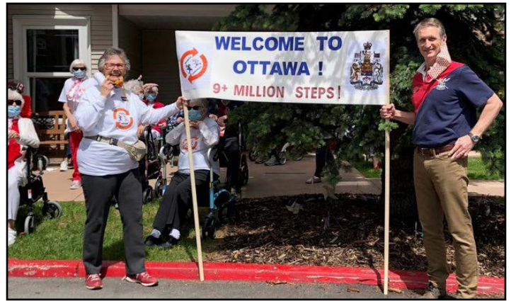
It was a pleasure this summer to watch the seniors of Manor Village at Garrison Woods walk virtually across Canada.

Many seniors tell me their costs have gone up, but the government has overlooked their needs.