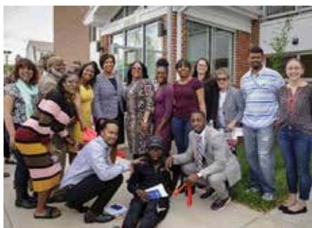
WIN celebrates opening of affordable housing units

• Celebrated the opening of 99 new affordable housing units in DC . • Delivered win to homebuyers in MA with $3.8 million in assistance towards a combination of lower interest rates and enhanced down-payment assistance.