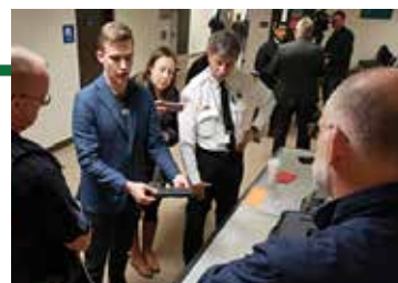
Common Ground Gun Safety Tech Expo

IAF's Do Not Stand Idly By (DNSIB) campaign organized a Gun Safety Tech Expo in Milwaukee, WI to press for responsible conduct in the gun industry. • DNSIB recruited a team of mayors and other local officials from CT, IL, MD, OH , and PA to launch the Gun Safety Consortium—the nation's first coalition of cities and counties dedicated to getting effective gun locks and safety products into the hands of police and civilian gun owners. • DNSIB also won public commitment from Chicago, IL Mayor Lori Lightfoot to work on safer guns, gun locks, and gun dealer reforms. • NJ Governor Phil Murphy and AG Gurbir Grewal signed onto the DNSIB campaign, becoming the first state to release data showing the manufacturers of guns used in crimes in the state. • Secured commitments from mayoral candidates in Houston, TX for handgun retail secure storage ordinance and public safety education campaign.