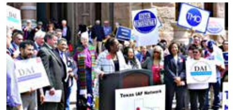
Texas IAF restoring funding for long-term labor market intermediaries

Increased wages from $12 to $14 per hour for 3,000 of the lowest-paid Houston Independent School District workers in TX . • Negotiated an average $9,000/year pay raise for teachers in Denver, CO . • Increased hourly wages from $8.40 to $15.00 for Alamo Community College workers in San Antonio, TX . • Texas IAF restored $4.5 million in state funding for long-term labor market intermediaries that move