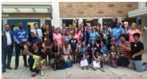
Action In Montgomery wins $60 million to rebuild schools

Won major funding increases for schools in MD, NC, NJ & VA , including $60 million in Montgomery County, MD , $7 million in Jersey City, NJ and $12.5 million in VA , allowing for rebuilds of high-poverty schools, after school programming for low- income students, and an increased school counselor-to- student ratio. • Revamped San Antonio, TX school district policy to expand access to campus activities for undocumented immigrant parents and won the demolition of a dilapidated building that would continually