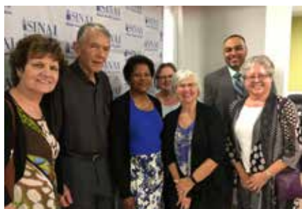
Metro IL celebrates the opening of Crisis Stabilization Unit

Restored drivers' licenses to 627,000 Virginians with unpaid court fees and fines. • Won a commitment to create a public defender office in Prince William County, VA , the first county to be a majority people of color county in VA . • Created alternatives to incarceration for people of color in Cleveland, OH by expanding access to Drug Court. • Won Clean Slate legislation introduction to wipe criminal records clean upon release in CT . • Won increase in Medicare/Medicaid funding for newly established Crisis Stabilization Units (CSU) in IL .