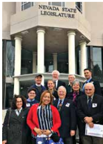
Winning payday reform in Nevada