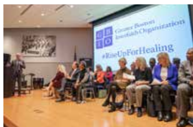
Greater Boston Interfaith Organization lowering prescription drug costs in MA

• Increased state medicaid reimbursement rate for Crisis Stabilization Units in IL , creating opening for statewide expansion. • Won $5.6 million for Los Angeles County Mental Health initiative that will provide targeted mental healthcare services for 145,000 immigrants. • Secured $2 million in Monterey County, CA to continue Esperanza Care program that provides full-scope healthcare for 3,500 low-income undocumented residents. • Expanded Medication-Assisted Treatment for opioid addiction in IL & NY , helping incarcerated individuals in jail and on parole. • Won $1 million for school mental health services in Howard County, MD .