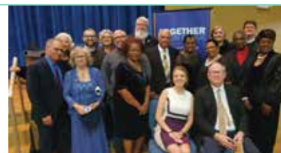
Together Baton Rouge GOTV Leaders

Restored drivers' licenses to 627,000 citizens with unpaid court fees & fines