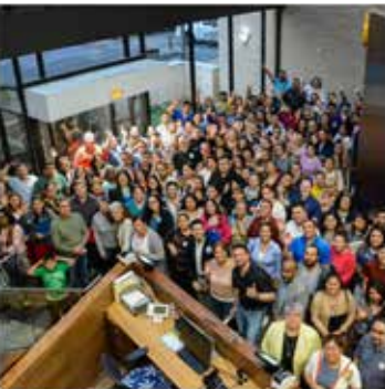
Dallas Area Interfaith - Recognizing the Stranger Training

Issued 12,000 parish identification cards in Dallas, TX to serve as alternative forms of ID for immigrants. • Won parish identification card acceptance by police, government agencies, and health care institutions in Baltimore, MD and the Rio Grande Valley, TX . • Secured $2.5 million