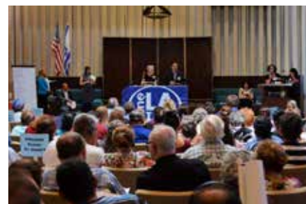
One LA-IAF working for change

Won sweeping reform in CA including: protection against eviction and rent increases for over 45,000 renters; mandatory mediation; and $20 million in funding for "Right to Counsel" programs. • Leveraged $1 million in displacement mitigation for displaced and vulnerable residents in San Antonio, TX . • Secured Fair Housing Law in Anne Arundel County, MD that removed discrimination based on forms of payment and won establishment of Human Relations Committee that has authority to subpoena landlords who violate the Fair Housing Law.