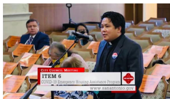
COPS/Metro Alliance, TX

After the economic shutdown caused sharp reductions in family income, IAF organizations stepped into the void to leverage relief for economically stressed families by winning eviction moratoriums and CARES Act funding for rental relief.