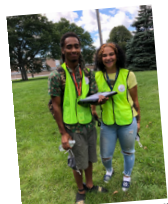
Common Ground, WI

Months of strictly non-partisan GOTV efforts by IAF affiliates resulted in increasing voter turnout and protecting the vote in historically low-performing precincts in AZ, CO, LA, NC, OH, TX and WI . Together Louisiana successfully blocked passage of