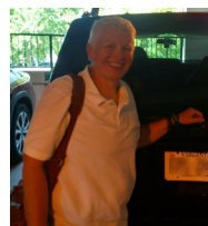
VA Resident License Restored

Greater Boston Interfaith Organization secured passage of an historic law which addresses police misconduct, deadly force and accountability, bringing MA forward as a national leader in police accountability reform. Congregations for a New Connecticut pushed and won new regulations for police accountability that include more diversity, decertification due to misconduct, and exhausting all alternatives before the use of deadly force.