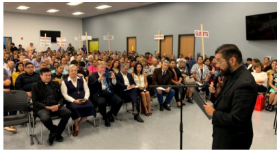
Valley Interfaith, TX

By retooling leadership training for remote-participation, the West / Southwest IAF built upon relationships established through the Recognizing the Stranger strategy and continued Spanish-language training engaging native-born allies to support public action that resulted in significant gains for immigrants including: expansion of the CA Earned Income Tax Credit program to include 600,000 working undocumented immigrants; eligibility for hundreds of millions of dollars in pandemic relief across TX ; hundreds of millions of dollars for AZ public schools -- the main source of education for 138,000 children of undocumented immigrants; and tens of millions of dollars in CO public school tech to bridge the digital divide for low-income and undocumented students.