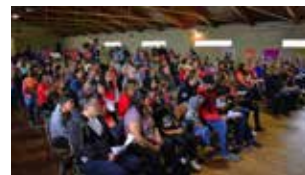
Colorado IAF securing commitments from Denver Public School Board

Working with the local teachers union, Colorado IAF secured support from members of the school board for increases in teacher pay, resulting in a 11% raise for teachers in 2019.