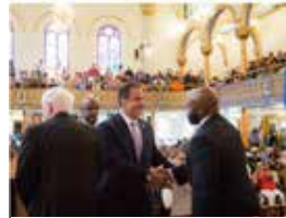
NY Governor Cuomo commits state funds for new senior housing

Won $2.2 billion to repair NYC Public Housing Authority (NYCHA) units where 500,000 black and brown New Yorkers live with mold, rats, no heat and other code violations; Forced NYCHA to agree to tough new standards for fixing mold and leaks in the 186,000 units of NYCHA public housing. Secured $500 million from NYC Mayor Bill de Blasio and City Council to begin construction on 15,000 senior units on vacant NYCHA land, which will free up NYCHA units for 150,000 low income New Yorkers.