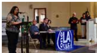
One LA increasing access for mental health services

Leveraged support of LA County Board of Supervisors in CA to provide access to mental health services for 150,000 low-income, undocumented residents.