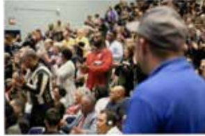
1,400 VOICE leaders celebrate Gov. Northam's commitment to restoring Suspended Drivers Licenses

Secured commitments from VA Governor & Attorney General to make ending cash bail, raising the felony level, eliminating excessive court fees & fines and restoring driver's licenses for 654,000 Virginians central issues in the VA 2019 statewide elections.