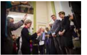
Greater Boston Interfaith Organization

Communities Organized for Relational Power in Action secured another $2 million from Monterey County, CA for full-scope healthcare for undocumented residents.