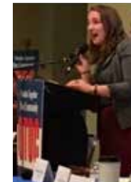
Omaha Together One Community