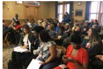
Southeastern WI Common Ground

Southeastern WI Common Ground halted development of notorious V-Live liquor franchise in a Milwaukee neighborhood and began work on temp agency employee mistreatment and expanding living wage jobs for formerly incarcerated and chronically unemployed people in Milwaukee.