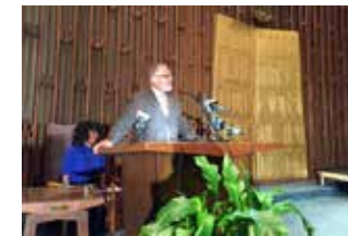
Working Together Jackson

350 Working Together Jackson leaders secured commitments from the Mayor of Jackson to rebuild West Jackson including $750,000 for fresh food store financing and keeping the Mississippi Zoo in West Jackson.