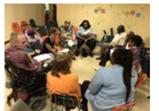
Voices Organized in Civic Engagement

350 Voices Organized In Civic Engagement leaders secured a public commitment from the Oklahoma City Sheriff to create a citizens advisory board for the county jail and launch it in 2019.