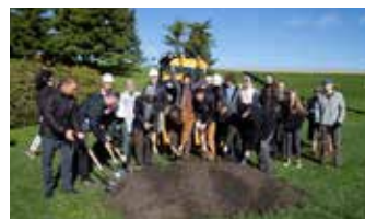
Mid-Iowa Organizing Strategy

Won approval of 146-bed behavioral health hospital in Waukegan and a commitment to establish a Crisis Stabilization Unit as an alternative to emergency room and jail.