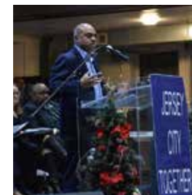
Jersey City Together

Jersey City Together drove the $170 million public purchase of an investment in a 95-acre Bayfront site, which will create 1,400 - 2,800 affordable housing units, won $5.3 million for public schools, and secured the first proactive enforcement of the city's rent control law.