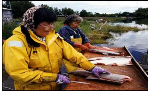
Unique Exposure Pathways