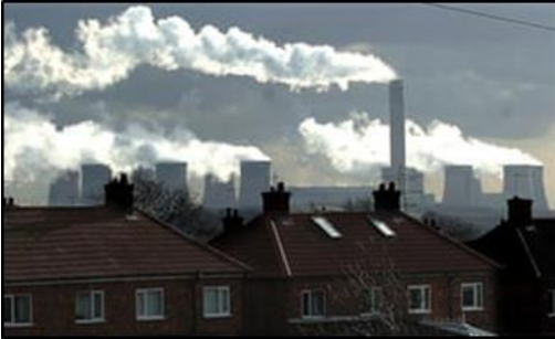
Proximity and Exposure