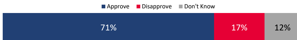
Figure 4: Approval of Oxnard City Government’s Response to the Coronavirus Pandemic

In addition, respondents largely approve of the job the City government has done to respond to the coronavirus pandemic (Figure 4). Over 70% of respondents said they approve of the job the City government has done, which is more than four times the number who disapprove (17%). Another 12% were unsure about how to rate the City’s performance on this issue.