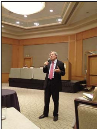
Dr. Erwin Chemerinsky speaks at the NACOLE conference in San Diego