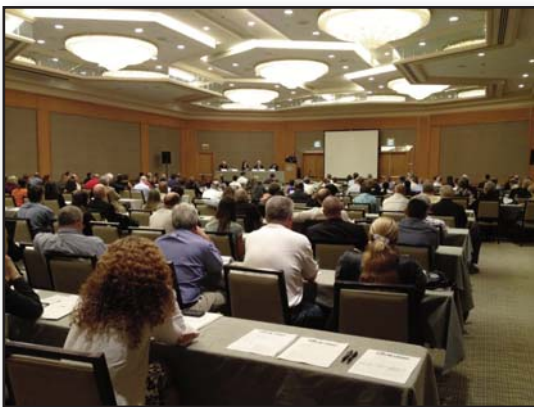
Participants in one of the many training sessions offered at the San Diego conference