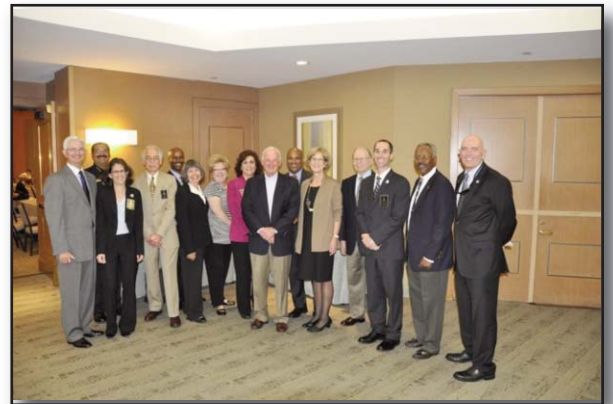
The 2012 NACOLE Board of Directors with conference attendees

NACOLE Flame Award recognizing his long commitment to advancing civilian oversight of law enforcement and civil rights, including eleven years as Chief Attorney of the Los Angeles County Office of Independent Review, where his innovation and creativity have built a national model of influential civilian oversight of the Los Angeles County Sheriff’s Department, the largest sheriff’s department in the country. He has also designed permanent