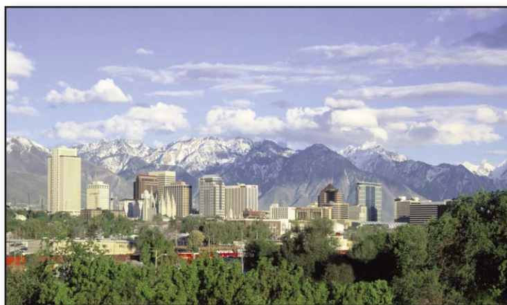
Salt Lake City Skyline.

There are numerous museums to visit including the Utah Museum of Contemporary Arts, the Natural History Museum of Utah, and the Utah Museum of Fine Arts. NACOLE attendees can take a stroll down gallery row, visit the Living Planet Aquarium, Utah's Hogle Zoo, the Tracy Aviary, Red Butte Gardens, the Clark Planetarium, and the Great Salt Lake, or tour Historic Temple Square. There are several theaters offering