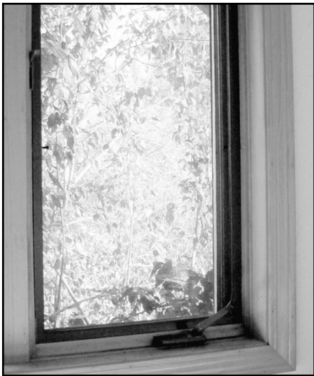
To keep boxelder bugs out, make sure your screens fit tightly and are in good condition.