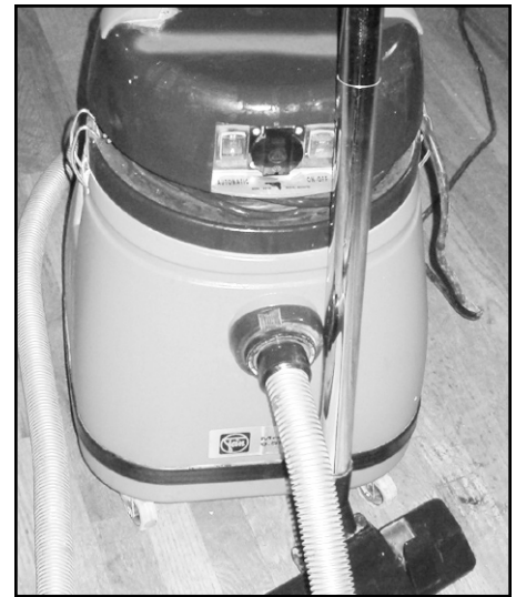
Use an ordinary shopvac to remove unwanted boxelder bugs.

between six and ten feet wide around your foundation. If you don't want to do this all the way around your house, focus on the south and west sides. 2