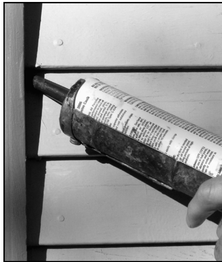
Caulk around windows and doors so boxelder bugs can't get inside.