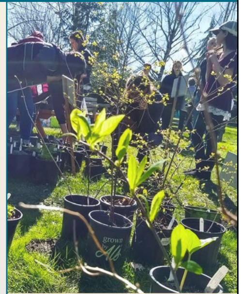
Wilsonville, Oregon Pollinator Workshop

National Marine Fisheries Service released its first comprehensive analysis of three insecticides on imperiled aquatic species nationwide, after years of pressure from NCAP and our allies in salmon conservation. Not surprisingly, the report showed that the pesticides chlorpyrifos, malathion and diazinon jeopardize the survival of the Northwest's threatened salmon and steelhead species. We will continue to monitor and press the EPA for reforms. NCAP also helped stop a state proposal to spray the toxic insecticide imidacloprid over two of Washington's most pristine estuaries: Willapa Bay and Grays Harbor.