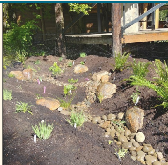
Rain Garden Install at Soaking It In Workshop