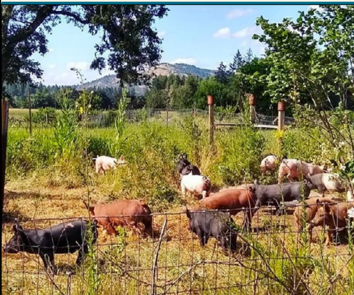
My Brothers' Farm Utilizes Pigs to Help Manage (Eat) Filbert Moth Worm in Hazelnuts on the Orchard Floor