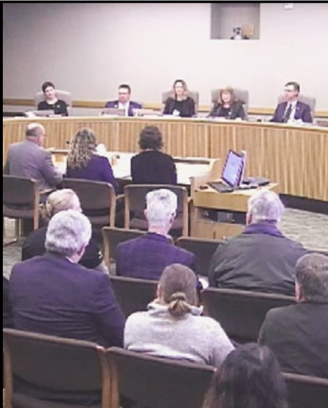
NCAP Staff Testify at Chlorpyrifos Hearing