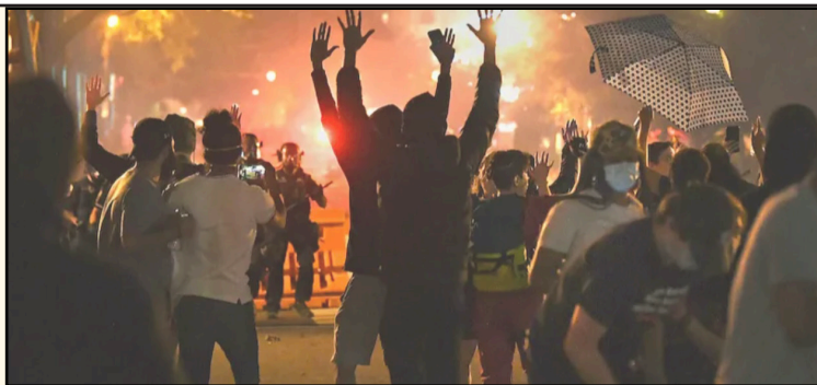
Protesters chant "Hands up! Don't Shoot!" as smoke from tear gas lingers in Lafayette Square.

After the murder of George Floyd in Minneapolis in May 2020, NCAP wrote a series of articles about the role of pesticides in violence, racism and the spread of COVID-19. We could not stay silent as protesters rallying against racism and the murder of Black and brown people were faced with brutality, pepper spray and tear gas. The articles touched on the history of chemical use against people by the U.S. government during war, pesticides as tools of control and oppression in the fight for racial justice, and health impacts. Read more: pesticide.org/blog