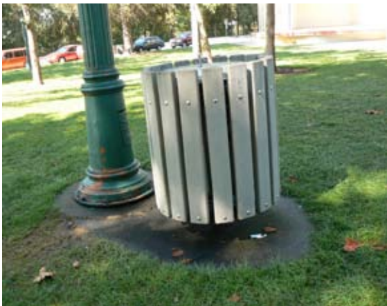
Installing this garbage can and lightpost side-by-side, rather than apart, in Julia Davis Park in Boise meant that only one mow strip was needed.

A newer concept, installing mow strips when a new park is designed or old park is renovated, is an example of wise long-term planning. New ADA requirements are resulting in hardscape replacement in some cities, like San Francisco, where Fiorello is advocating for the addition of mow strips along the replaced paths. 8 Although mow strips add to the cost of construction, in the long-term the money saved on weed control will be greater than the initial cost. Clustering fixtures together, in order to minimize the number of mow strips needed, can save money.