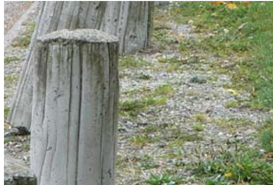
Over time, this gravel in Alki Park in West Seattle has filled-in with dirt and weeds because it was too coarse.

In some cases, gravel has been laid in a park in an attempt to reduce the area to be maintained but has unsuccessfully suppressed vegetative growth. 9 For example, in Alki Park, a pesticide-free park in Seattle, a gravel area surrounds 2-foot concrete columns that serve as barriers to vehicles. The gravel is coarser than the quarter-inch minus rock that Renfrow (Seattle) recommends. As a result, soil has settled in and weeds have grown. Removing all of the gravel would be a challenge, and the finished product would need to be level with the surrounding turf. As Phil explains, instead of removing the gravel, a layer of quarter-inch minus rock could be laid to smother the weeds over winter. In the spring, a 1-2-inch layer of quarter-inch minus rock could be laid and compressed to form a new hardscape. Another option would be to seed grass into the original loose gravel to gradually blend the area visually into the surrounding turf. 9