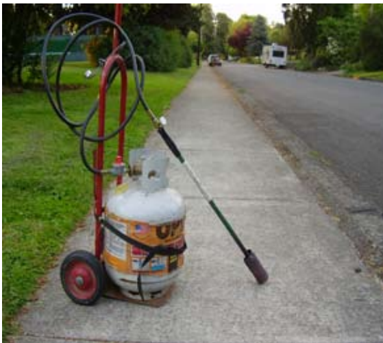
Propane-powered flame weeder attached to a dolly-mounted tank

According to Fiorello, 10-pound, backpack-mounted tank devices are more efficient than the dolly-mounted alternatives, but most users prefer to haul a dolly-mounted tank around because they are concerned about wearing explosive material on their backs. 8 The most appropriate type of flamer for hardscapes and fence lines is the kind that has a narrow nozzle and shoots a flame from the end, such as the Red Dragon. 8,11,12 Although the single-headed version is depicted, Nicholson recommends the more powerful and efficient double-headed version for use in parks. 12