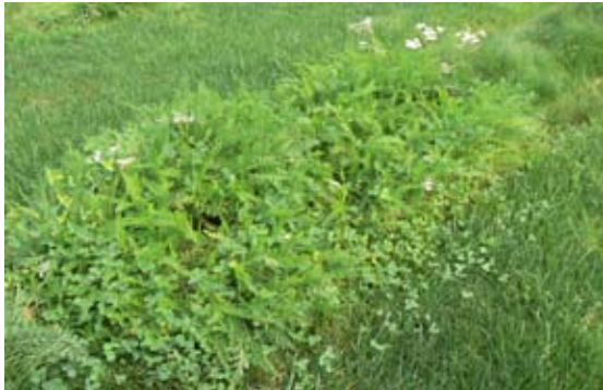
This dense ecolawn mix test plot, planted by Rob Hallett (Eugene), grows faster than the surrounding irrigated turf and out-competes weeds.

and fertilization. “Ecolawn” mixes grow densely and out-compete weeds. They require some time to establish; therefore, “starting with a clean slate is important.” Hallett (Eugene) explained that ecolawn mow strips require different management from most turf. 2