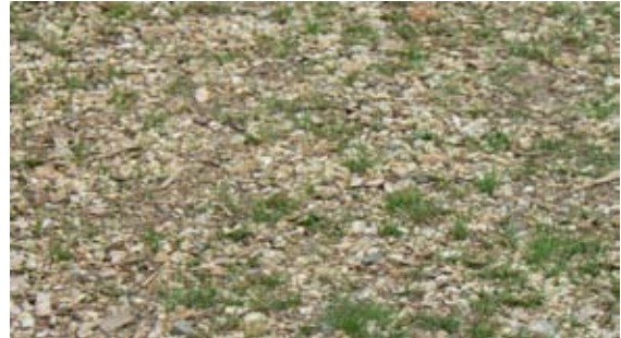
Over time, as growing substrate fills-in the spaces between rock particles, weeds emerge from a coarse decomposed granite softscape in the San Francisco Botanical Garden. (below)

DG, in particular, has an appealing golden appearance favored by landscape architects, and San Francisco city departments in the past have used DG in many high-profile areas, such as the Botanical Garden and Band Concourse. 6 However, as Fiorello (San Francisco) notes, quality DG is difficult to find and increasingly expensive. 8 To conserve this material and reduce cost, its use is often limited to a thin veneer application over conventional compacted road base. However, this often leads to problems with coverage, erosion, and runoff of the granite. According to Fiorello, DG used to be coarse, permeable, durable, and suitable for wheelchairs and strollers, which was ideal. Now, as the supply runs out, a product that is labeled the same is actually quite different. It is finer and muddy when wet and does not suppress weeds as well. Commercial binders made from tree resins or polymers, marketed to firm up decomposed granite and similar materials, can be difficult to work with and can often lead to gouging and a breaking away of the paved surfaces over time. 8