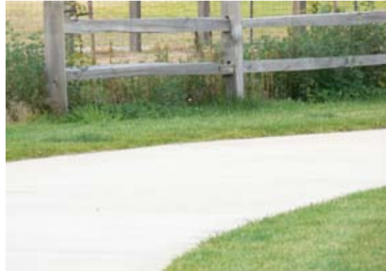
Installed in Candelight Park in Eugene after the initial park design, the wooden fence with no mow strip underneath serves as a weed haven.

Sometimes a fixture, such as a fence, is unnecessary and can be eliminated from a project during the planning phase without reducing aesthetic, safety, or other values. If needed, minimizing the length of the fence and placing it only where needed can help to reduce cost. 13 Whenever a new fence is planned, Belanger (Boise) requests that the bottom rail be at least two to three inches above the ground to allow weed abatement with a line trimmer, or “weed eater.” 5