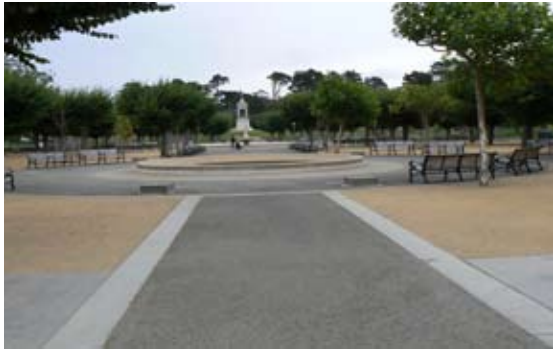
Decomposed granite softscape adds contrast and sophistication to the Band Concourse in San Francisco's Golden Gate Park.

Phil Renfrow, Senior Gardener, Seattle Parks and Recreation, suggests using “quarter-inch minus”-sized gravel instead. It is cheap, durable once compacted, and the ideal coarseness. 9 Weeds can grow in finer gravel, and dirt fills in the spaces between the coarser gravel particles. The use of “quarter-inch minus” gravel is also compliant with the Americans with Disabilities Act (ADA), allowing people in wheelchairs to pass over without difficulty. 9