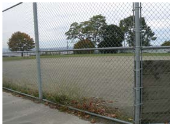
A sports infield behind this fence in the park at Yesler Community Center in Seattle is kept weed-free using a Harley rake tractor attachment.

Seattle uses a tractor attachment, called a Harley rake, to scrape away weeds in dirt paths and to level sports infields. 10 The machine can be set to cut to a certain depth for stripping weeds or grading. A roller at the rear leaves wind-rows of weeds behind for easy pickup and it grades as it goes, a “really elegant design,” according to DeCaro (Seattle). The machine needs to be used every year to kill the weeds while they are young but cannot be used in the wet season, as it will not operate in the mud. Early fall is a critical time to use the Harley rake, DeCaro says. A versatile machine, the Harley rake can also be used for cutting sod and tilling. 10