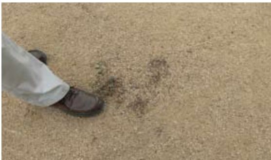
With his shoe, Phil Rossi points to a weed emerging from this fairly weed-resistant and fine decomposed granite softscape of the Band Concourse in San Francisco's Golden Gate Park. (above)

To create a unique or perhaps more natural appearance, compressed, crushed rock is sometimes used instead of concrete or asphalt under fences and as a pathway material, although the crushed rock can create a hazard when used with string trimmers. 6 Often referred to as “softscapes,” the rock particles, such as decomposed granite (DG), are laid and then compressed, using a vibrating machine or roller to form a firm surface that is weed-resistant. Weed pressure does increase over time. 1