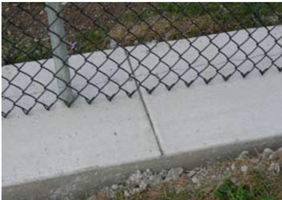
Concrete mow strip is segmented into blocks, with expansion joints.

Installation of mow strips under or around fixtures, such as fences, garbage cans, and benches, minimizes the need for weed control and can reduce herbicide use. Mow strips reduce the surface area that supports weed growth and also provide mowers needed space to travel close to and around obstacles without bumping into them, thereby decreasing the risk of damage to equipment and structures. 1 Bob Fiorello, Gardener with the San Francisco Recreation and Park Department and Pest Control Advisor of the San Francisco Botanical Garden, points out that mow strips also limit the need for line trimmers or small mowers, thereby increasing the feasibility of using larger equipment, which saves departments money. Therefore, mow strips are a good investment, saving money in the long-term by allowing staff to maintain parks more efficiently. 1,2,3