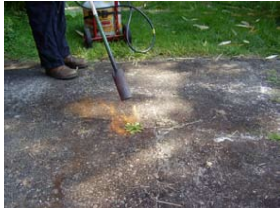
Flame from flame weeder passing over dandelion

Although the propane-powered Red Dragon flame weeder produces a flame, burning the weeds is not actually necessary; rather, blanching with the heat radiating beyond the end of the flame is sufficient to kill weeds and does not produce a burned appearance. “Green flaming” involves a quick pass (a rate of about 1-2 seconds per foot) of the 2000° F heat from the nozzle over the weeds to sear them, Fiorello (San Francisco) says. 8 The short exposure to the intense heat is enough for plant cell walls to burst. Treated weeds will wilt and die, a process accelerated by warmer weather. 8 Fiorello evaluates green flaming efficacy by the “thumb print” test, in which a treated leaf is pressed firmly to leave a tell-tale print, indicating that cells are disrupted and the treatment will work. 1 Green flaming causes gradual death so that the plant is less likely to signal the roots to re-grow. 1,8,11 “Think of blanched weeds rather than blackened weeds,” Fiorello suggests. 1 Green flaming also conserves fuel over weed burning. Even under ideal conditions, repeated treatments are needed to kill the weeds. Over time, flame-treated weeds will die because they are not able to photosynthesize when their green tops are knocked back repeatedly. Although some staff and some parks patrons feel that flaming is unsafe, the safety risks can be minimized when done at the proper time – when there are no patrons around and during the wet season