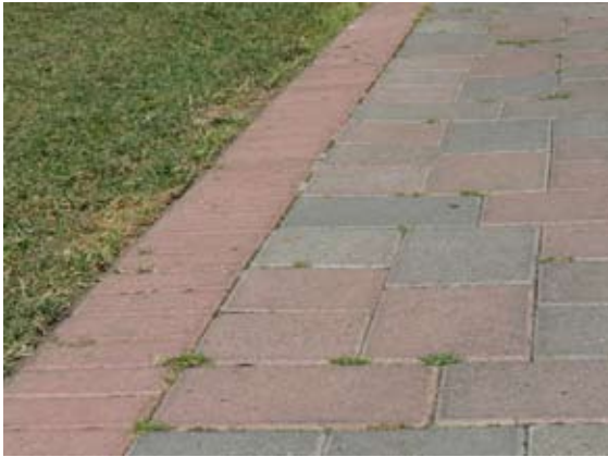
A long brick path in a park in Bend has weeds.

A newer concept, installing mow strips when a new park is designed or old park is renovated, is an example of wise long-term planning. New ADA requirements are resulting in hardscape replacement in some cities, like San Francisco, where Fiorello is advocating for the addition of mow strips along the replaced paths. 8 Although mow strips add to the cost of construction, in the long-term the money saved on weed control will be greater than the initial cost. Clustering fixtures together, in order to minimize the number of mow strips needed, can save money.