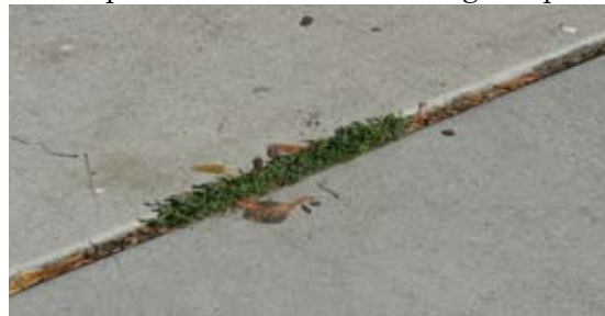
This hardscape crack, filled-in with soil, has become the perfect planter for weeds. (above) Caulking prevents hardscape cracks from filling in with soil. (below)