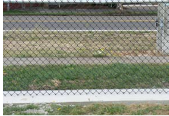
A concrete mow strip under a fence along a sports field in Ida Patterson Park in Eugene.

newly constructed Ida Patterson Park in Eugene three-fold, but the savings on weed control will surpass this extra initial cost.