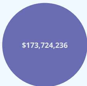
2014-2015 State funding for Bridgeport Local School District

District Funding Total: About 174 million dollars