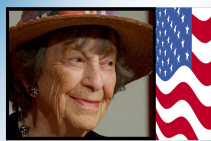
Doris "Granny D" Haddock 1910-2018 Legendary Campaign Finance Reform Activist Bentley Commons 197 Water St. Keene, NH Saturday, October 6th at 3:00PM