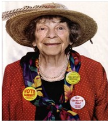
Doris "Granny D" Haddock