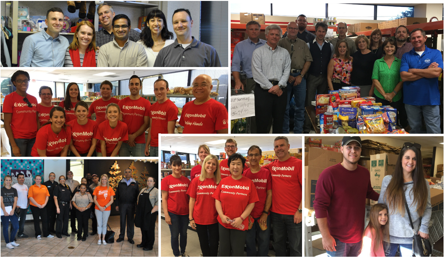
LEFT TO RIGHT, CLOCKWISE: EXXONMOBIL CHEMICAL COMPANY; STREAM-FLO GROUP OF COMPANIES; TRIPLE CROWN BINGO; EXXONMOBIL CORPORATION; WHATABURGER; EXXONMOBIL REFINING & SUPPLY.