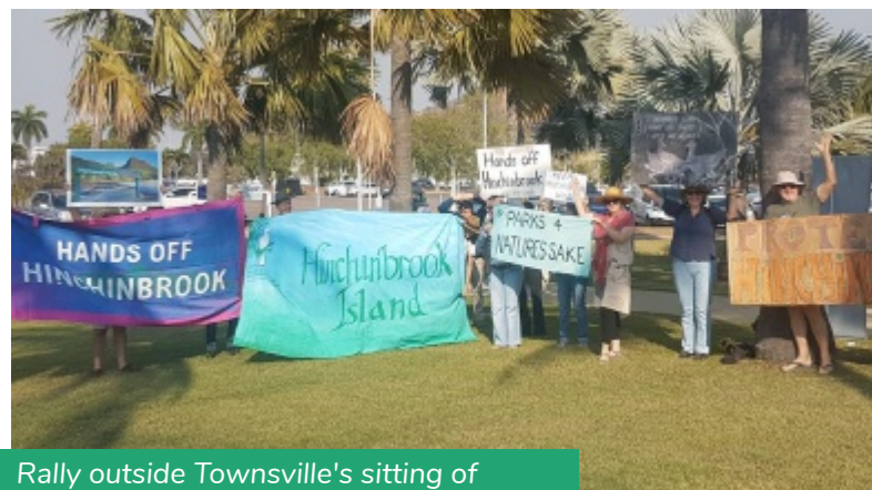
Rally outside Townsville's sitting of Queensland Parliament.

The issues raised in these meetings included private leases in National Parks, the lack of protection for Mahogany Glider habitat, climate change impacts on flying fox species, reef regulations, a transition to a low-carbon economy and the North Queensland Regional Plan. On the final day of the Regional Parliament, we held a demonstration against the privatisation of Hinchinbrook Island National Park. A massive thanks to our wonderful supporters who attended this demonstration – particularly those who made a special trip to Townsville in support of our National Parks!