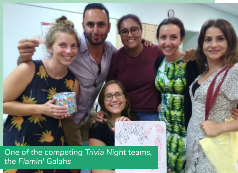
One of the competing Trivia Night teams, the Flamin' Galahs

Next year we hope to continue this silly tradition, so be prepared!