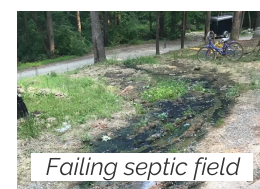
Failing septic field