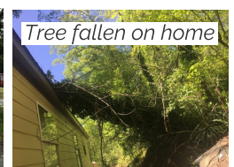
Tree fallen on home