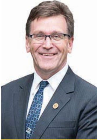
BILL WALKER Progressive Conservative

In the next few days, the Ontario government will vote on Bill 47, a bill to take away your workplace rights and reduce the penalties for employers who break the law. Unless we stop it, Bill 47 will cancel: