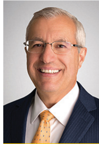
VIC FEDELI Progressive Conservative

In the next few days, the Ontario government will vote on Bill 47, a bill to take away your workplace rights and reduce the penalties for employers who break the law. Unless we stop it, Bill 47 will cancel: