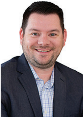
MIKE HARRIS Progressive Conservative

The Ontario Government, and your MPP Mike Harris, chose to side with big business and vote for Bill 47. Bill 47 took away your workplace rights and reduced the penalties for employers who break the law. This is shameful.