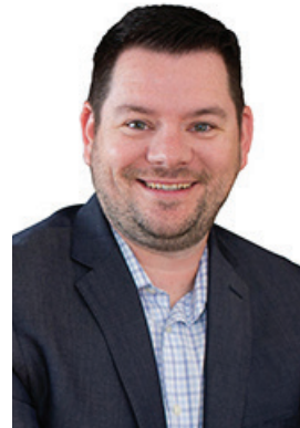
MIKE HARRIS Progressive Conservative

The Ontario Government, and your MPP Mike Harris, chose to side with big business and vote for Bill 47. Bill 47 took away your workplace rights and reduced the penalties for employers who break the law. This is shameful.