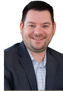
MIKE HARRIS Progressive Conservative

Your MPP, Mike Harris, took away your workplace rights and reduced the penalties for employers who break the law. This is shameful.