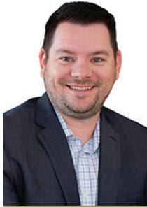
MIKE HARRIS Progressive Conservative

Your MPP, Mike Harris, took away your workplace rights and reduced the penalties for employers who break the law. This is shameful.