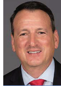
GREG RICKFORD Progressive Conservative