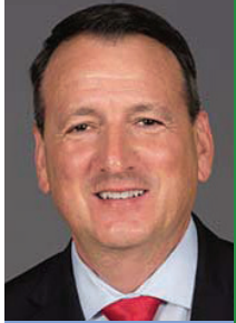
GREG RICKFORD Progressive Conservative