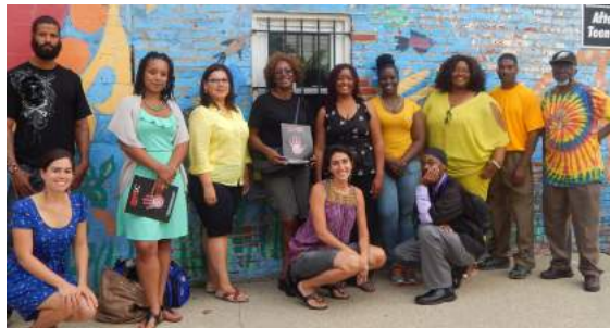
People's Platform members meet with DHCD, DMPED, & DMGEO to present demands