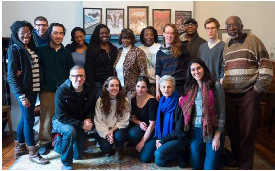
#TakeBacktheStreets week of action against police terror & displacement