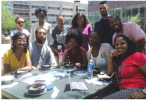
Mount Vernon Plaza tenants hold vigil to protest displacement