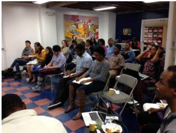
2nd Annual Equitable Development Conference