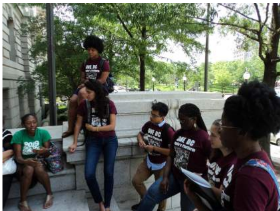
People's Platform members go on 3-day strategic retreat