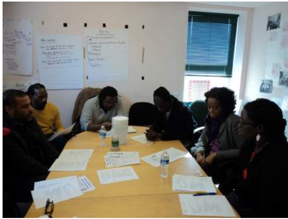
ONE DC members attend the 2nd National Black Workers Center Convening in Oakland, CA