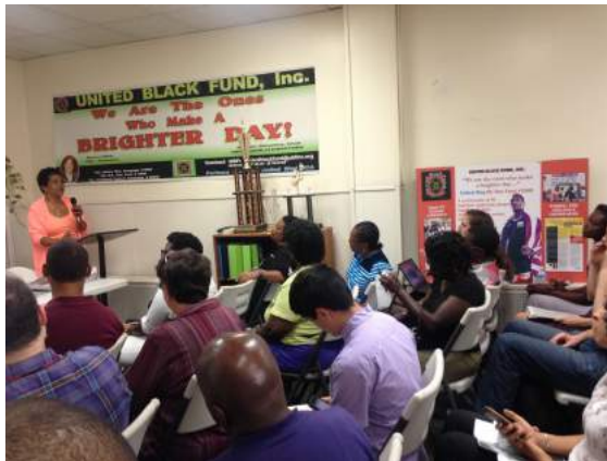
ONE DC members attend Movement for Black Lives Convening in Cleveland