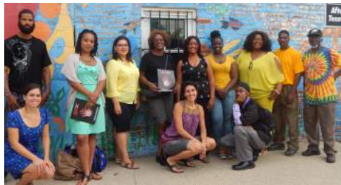
ONE DC members who traveled on coop learning journeys to Philadelphia are building a solidarity economy movement in DC.

"Why remain subordinated to the will of transnational corporations, States, and international institutions that identify themselves with exclusionary interests, if together, with our collective force, we can create public spaces, states, and new organizations that serve society's empowerment, so that it becomes the leading subject of its own development in an autonomous and self-reliant way?"