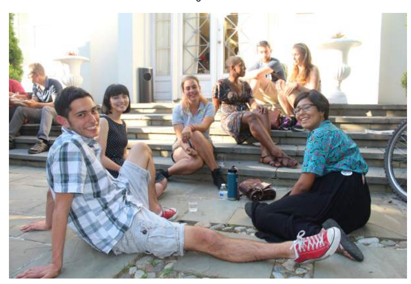
We at ONE DC cannot express how grateful we are for the honor of ten years of working with DC residents. Through our triumphs and our trials, we always come out on top because we have the support of a community who believes in our work. From the bottom of our heart, to our members, our volunteers, our supporters, our sponsors....