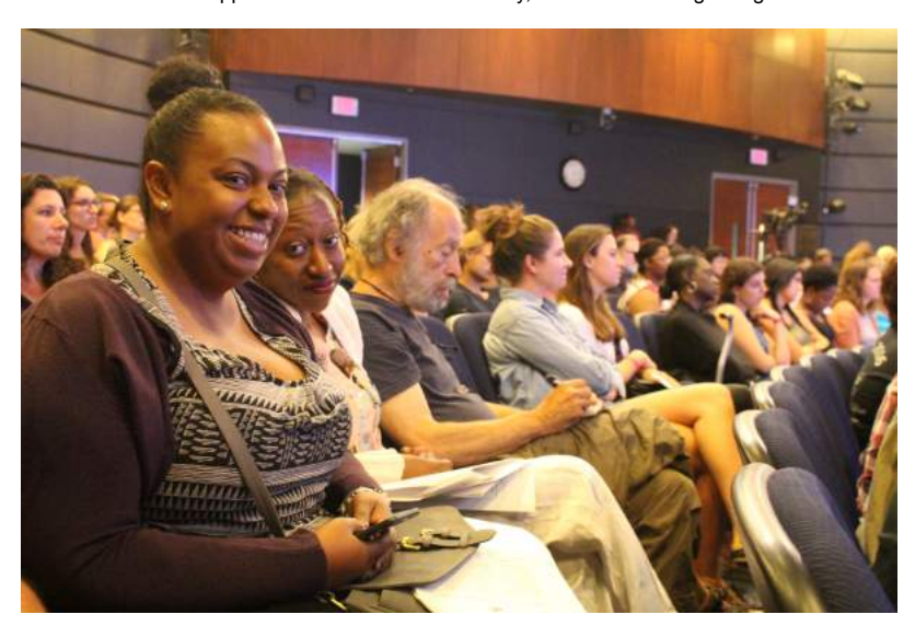
First, we learned and coordinated with vendors in our marketplace.