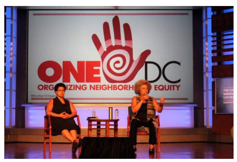
We heard moving testimonies by some of our members.