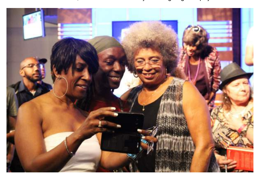
Thanks to the support of our extended community, this event was a glowing success.

On Juneteenth Weekend, ONE DC celebrated 10 years of fighting for equity in the District!