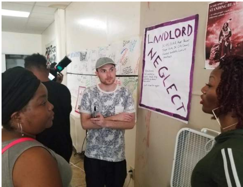
Participants share their experiences of landlord neglect in DC within breakout groups: “The whole soap dish was black from mold. Then they hired inexperienced workers who mishandled it.”