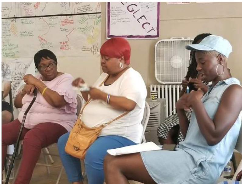
Some people felt they couldn't be secure in housing unless they could afford to buy a house: “The system is responsible and they keep doing it to us. They wouldn't do this if it was white people.”