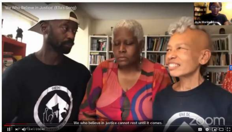
Worker Cooperatives and the Movement for Socialism

The Right to Income Committee is also working on: