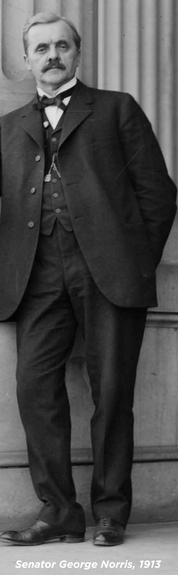
Senator George Norris, 1913

In 1934, Nebraskans answered the challenge of that moment with a broad set of democracy reforms; voting to purge half their state legislature and enact a nonpartisan election system. No one may run for a seat in the legislature under the banner of a political party. U.S. Senator George Norris, a progressive Republican who put all his political capital behind advocating for the reform, “believed that a one-house legislature would be more transparent, that its members would be more accountable to voters for their actions, and that it would cure a significant flaw in bicameral systems by eliminating the need for conference committees, which too often acted in secret and without sufficient checks on their power.” 2