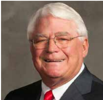
Speaker of the Legislature Senator Galen Hadley (R)

N ebraska's state legislators are proud of the independence that their state's nonpartisan system offers them in pursuing a constructive agenda: