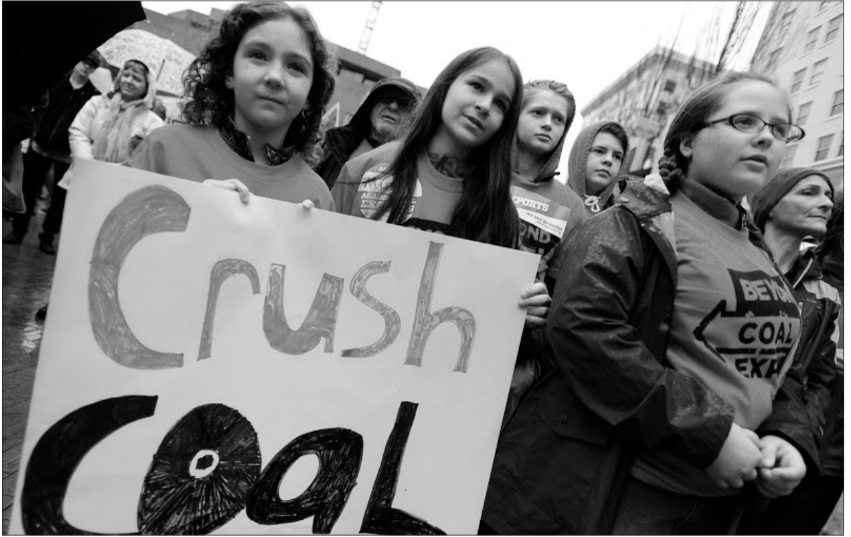
Young people express opposition to coal exports at the March 8 th rally at Portland's Pioneer Square.