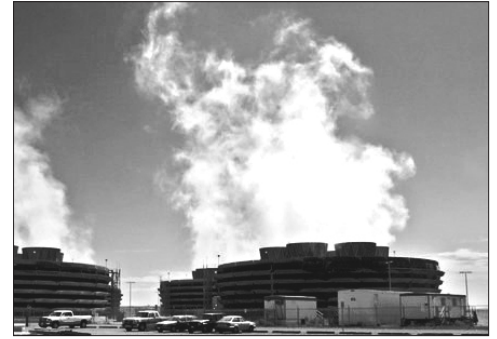
The Columbia Generating Station nuclear plant

“PSR believe that it is our duty to reduce the global risk of climate change and the regional risk to public health