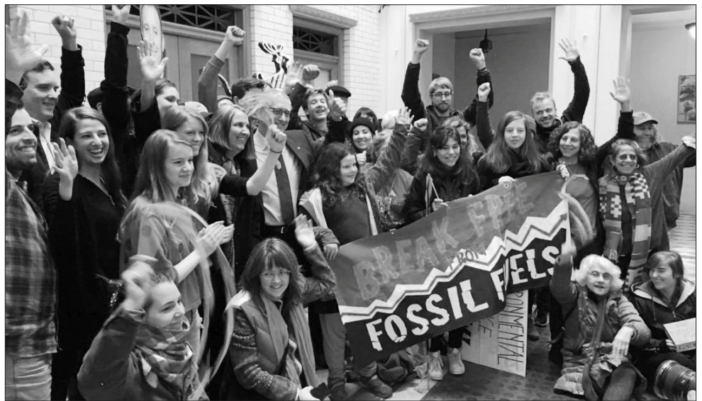
Climate activists celebrate the passage of the City of Portland's historic fossil fuel resolution late last year.

Here's a sampling of Oregon PSR's local work to keep fossil fuels in the ground: