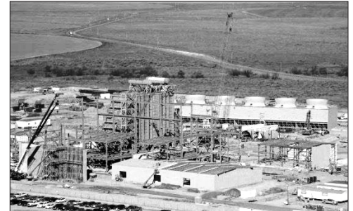
Carty Generating Station.

Wastewater from fracking has been known to contain chemicals such as benzene, formaldehyde, and petroleum distillate. From extraction to delivery, fracking also releases volatile organic compounds into the air including benzene, toluene, ethylbenzene, and xylene. These chemicals can cause various cancers, blood disorders, lung