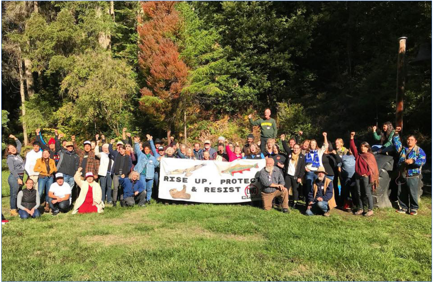
Activists gather in November to develop strategies for opposing the proposed Jordan Cove fracked gas facility and Pacific Connector Pipeline in Southern Oregon.