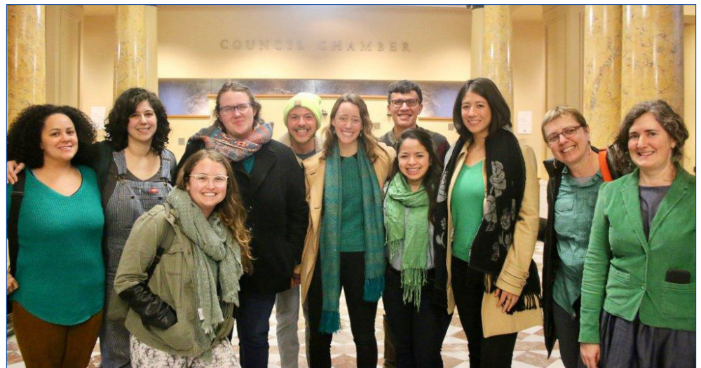
Portland Clean Energy Initiative volunteers celebrate the passage of Measure 26-201 at Portland City Hall.

Now, the City of Portland is working with the coalition that passed Measure 26-201 to implement this first-of-its-kind climate justice initiative. Leaders from communities on the front lines of climate change continue to be at