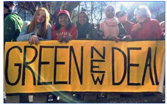
Portland students join the global youth climate strike in March.

This year's Greenfield Peace Writing Scholarship question for Oregon high school juniors and seniors is: