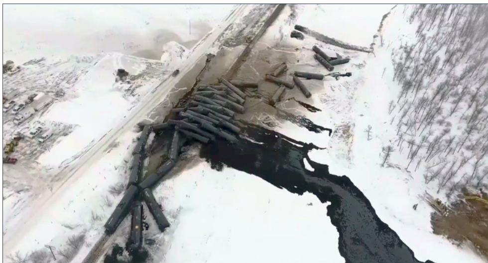
An oil train derailment near the Assiniboine River in Manitoba, Canada.

Zenith, formerly Arc Logistics, is adding infrastructure to increase the volume and frequency of oil trains moving through the Columbia Gorge into NW Portland. From there, it exports oil to a refinery in China. While we've had success in efforts to prohibit new bulk fossil fuel infrastructure within Portland, we need new