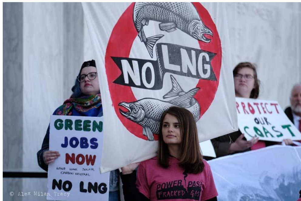
Protesters in Salem rally against Jordan Cove's energy projects

In May 2019, the Oregon Department of Environmental Quality denied Pembina's application for a Clean Water Act permit necessary to build the project. In January 2020, fearing a permit denial, Pembina ended its two-year-long attempt to receive a Removal-Fill permit from the Oregon Department of State Lands. Less than a month later, the Oregon Department of Land Conservation and Development denied the Coastal Zone Management Act's federal consistency review of the Jordan Cove LNG proposal. Jordan Cove LNG cannot go forward without all three of these necessary state permits. Despite these many rebukes, the Federal Energy Regulatory Commission voted to conditionally approve Jordan Cove LNG, which allows the company to pursue eminent domain proceedings to seize unyielded land for the project.