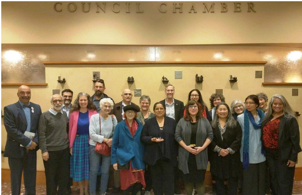
Celebrating passage of the Portland City Council nuclear weapons & Iran resolutions.