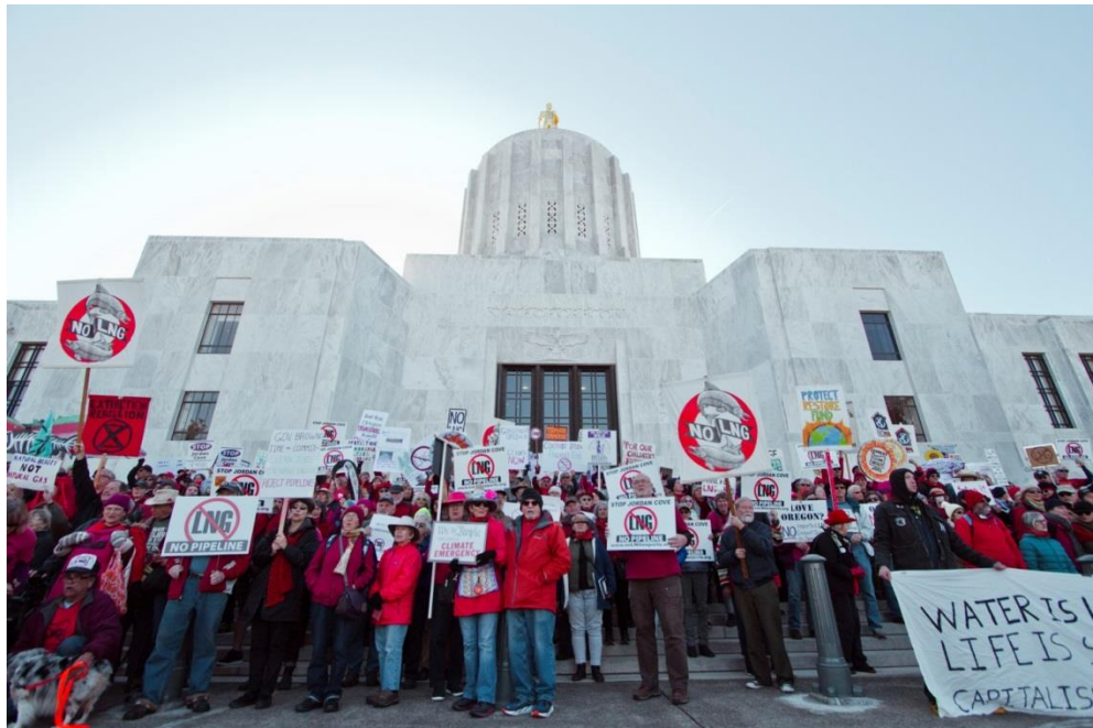
Jordan Cove LNG protest at Oregon's state capitol in Salem