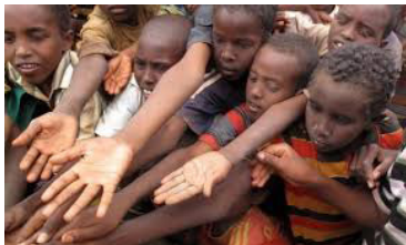
Hunger in Somalia.

Countries where the US has had sustained warfare are among the world's top emergencies for hunger and famine. Instead of offering to share the abundance of food in the US, 40% of the aid these countries receive is in the form of military hardware and occupation by US troops. In addition, US aid isn't given based on need but rather is based on military interests. The biggest recipients of US aid are Afghanistan, Israel, Egypt and Iraq.