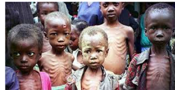
Starving children in Somalia

In 2008, the United Nations said that $30 billion per year could end hunger on earth, as reported in the New York Times, Los Angeles Times, and many other outlets. The Food and Agriculture Organization of the UN tells us that number is still up to date.