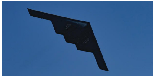
A B-2 Spirit bomber performs during a flyover

Unfortunately, these tributes are an exciting (and costly) way to attract young people to join the armed forces and promote militarism as US policy.