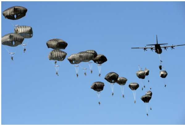
Airborne training operations are to take place during a June 2020 drill called Allied Spirit involving American and Polish forces.

There is reason to be seriously concerned about this turn of events. Most Americans are fully distracted from US foreign affairs while struggling to survive a deadly pandemic. This provides an opportunity for militarists to move forward with plans that could lead to deadly international conflicts.