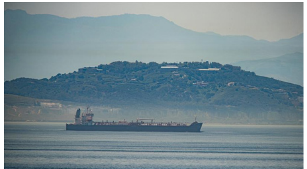
Iranian tanker heads to Venezuela.

armed contingent of Venezuelan Army deserters and Maduro opponents was led by former US Green Beret Jordan Goudreau, who now heads a private mercenary group called Silvercorp. Eight more infiltrators, including two US nationals with connections to Silvercorp, were captured the next day, thwarting their Bay of Pigs-like plan to enter Caracas and stage a violent coup.