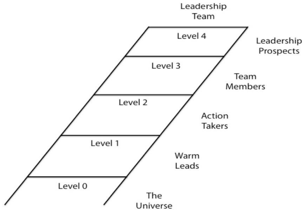
PIH Engage Leadership Ladder